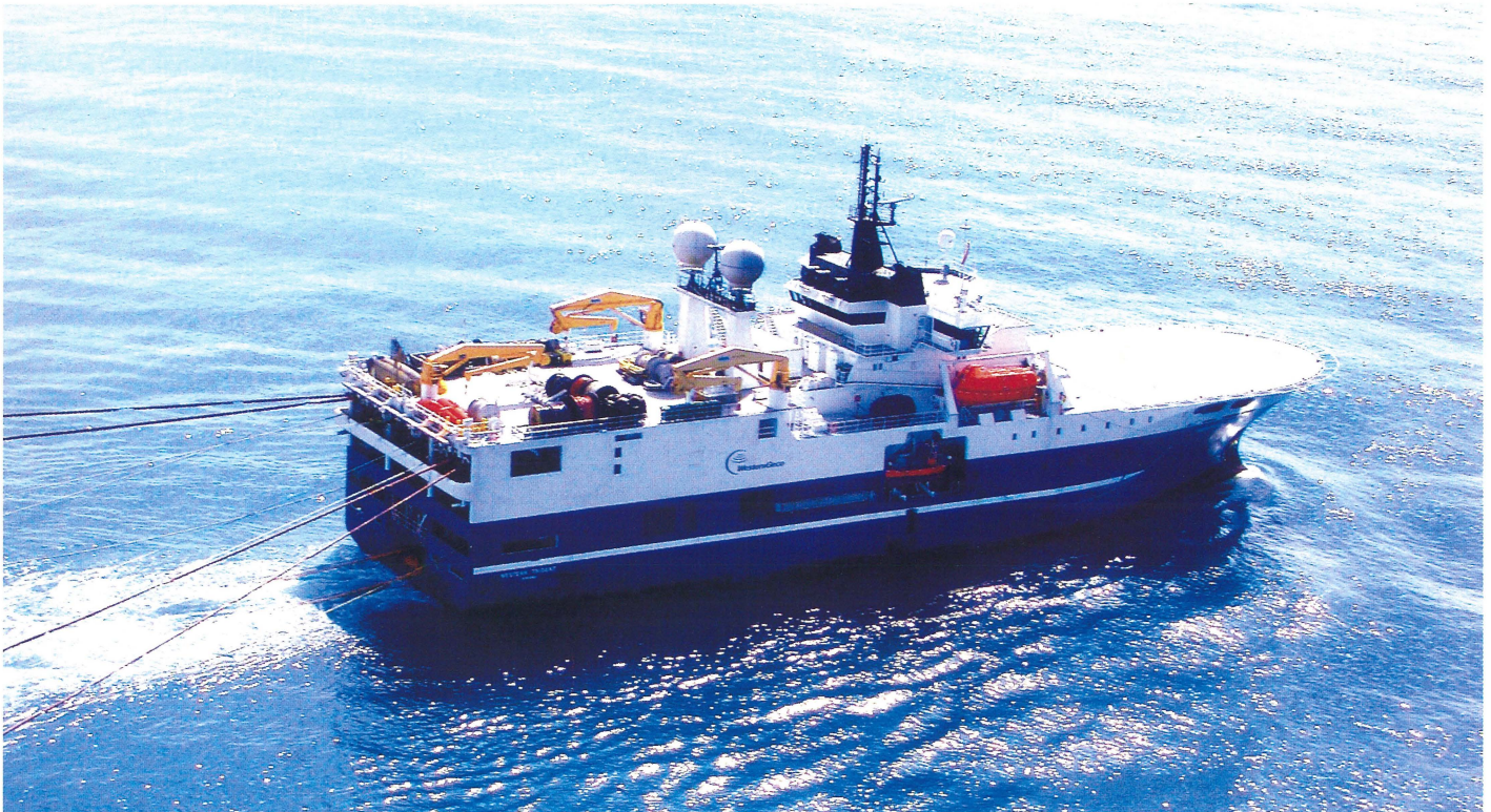
The state of the art Western Trident vessel will carry out the 503 km 2 Marie survey in the Gippsland Basin, starting in late February. The survey is expected to take about 2-3 weeks to complete, depending on the weather.

A 3D seismic survey, estimated to cost up to $20 million, is set to begin in late February over the Marie prospect in the offshore Gippsland Basin by the Western Geco vessel Western Trident.